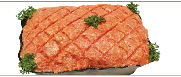
Meat Loaf Ready for the oven, quick, easy and delicious!