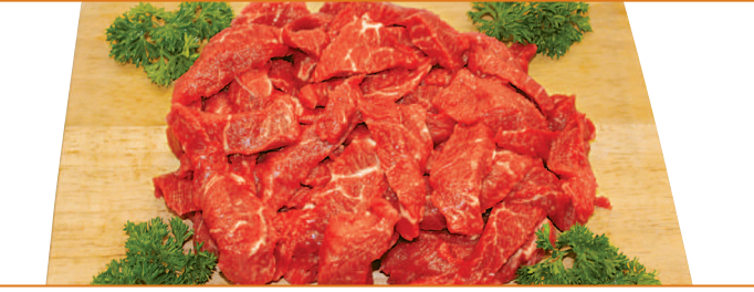
Beef for Stroganoff