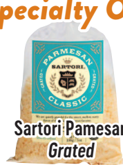
Sartori Pamesan Grated