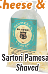
Sartori Pamesan Shaved