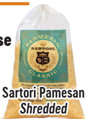
Sartori Pamesan Shredded

6.29 Ea. 7 oz. Packages Regular Price: $7.29 Ea.